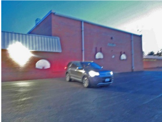
We parked behind the school facing I-88.