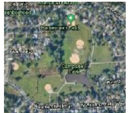
A live fox (K9JK) and 4 remote foxes are hidden in Campanelli Park