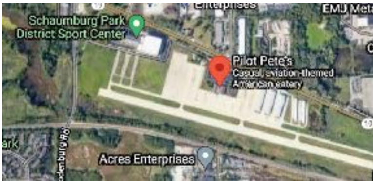
Starting point for the 5th Sat hunt.

Fox 1 transmitted 30 seconds every 2.5 minutes. Foxes 3-5 transmitted 30 seconds after fox 1 finished. Fox 2 was random.