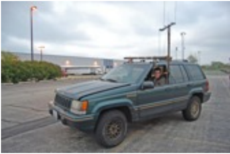
Charlie is ready

We chose this location since even though it was long haul from the start point, it was straight South and we had a good elevation. Regardless of the terrain, we tried several attempts to contact AA9CC using a 4 element beam pointed at the start location. We finally had to kick our wattage to 75 and were heard by all hunters. We maintained an extremely accurate interval using an interval timer app on the iphone. Tony made several passes along Rt 30 but due to the high Tx power we were using, he had all attenuation switched in and thought he was right on top of us but still had to do some sniffing. Although we anticipated arrivals to come in from Rt 30, the majority of the hunters bush wacked from the south from a bike trail through a corn field. We watched as LED flashlights danced around some several hundred yards out along a tree line. I guess Tony has trained everyone to sniff in the rough. By 9:30 we all entered Beggar's Pizza right on the premise and enjoyed some great pizza, except for Mike who had to wait for his pizza to be re-made with "pepperoni on the outside".