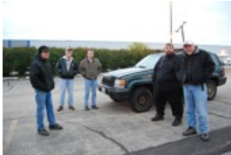
Hunters discuss things before the hunt.