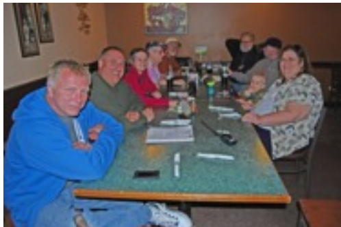
The foxes and hunters at the main table.