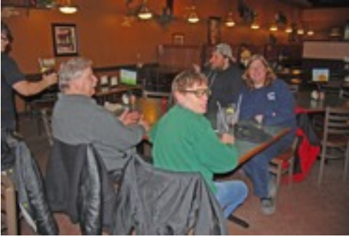
The rest of the hunters.