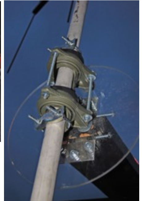
K9TOW Antenna Mount