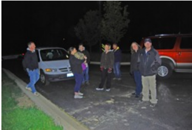
Hunters gather after the hunt