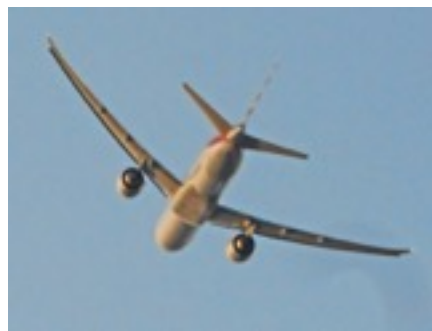
The jets were very low taking off over the starting point.