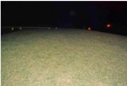
My hiding spot from the bottom of the hill. The white dot at the top is the battery case.