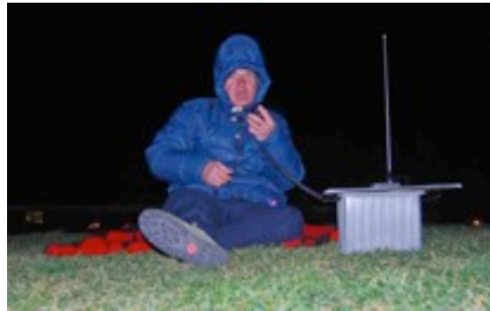
On top of the hill with soft pad to sit on.