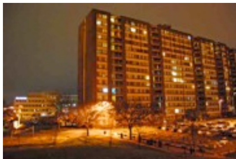
The high rises to the north.