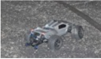
Several radio-controlled race cars were speeding around at the starting point. This one got close enough to get a good picture.